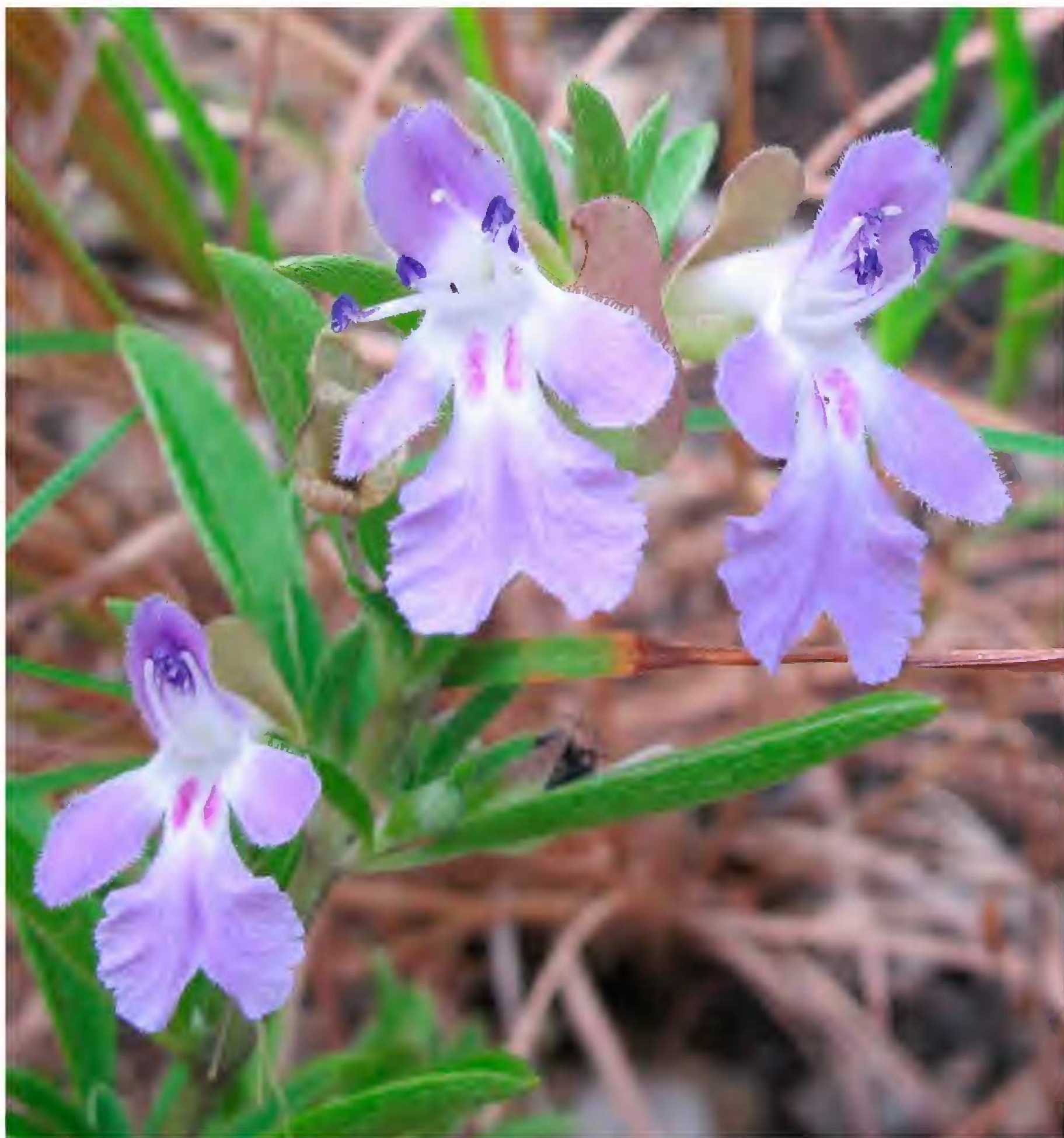
Figure 2. Prostanthera clotteniana . Flowering branchlet of plant growing in the Ravenshoe State Forest (A. Ford 5982 & Collins).

base gradually long-tapering; margin entire; apex obtuse to shortly acuminate; venation indistinct, midrib indistinct. Inflorescence a frondose racemiform conflorescence, uniflorescence monadic; 2–4(–6)-flowered [per conflorescence]. Podium 2–4 mm long, densely hairy and glandular. Prophylls persistent, inserted near base of calyx [ a_1 axis to anthopodium ratio 2–6], opposite, narrowly obovate, 3–5.5 mm long, 0.3–0.5 mm wide [length to width ratio 8.3–10(–13.8), length of maximum width from base to total lamina length ratio 3–4(–5.5)], moderately to sparsely hairy (hairs as for leaf lamina), moderately to densely glandular; base attenuate; margin entire; apex apiculate; venation not visible. Calyx dull green, sometimes with maroon on adaxial lobe; outer surface sparsely to moderately hairy, becoming dense towards base, with hairs white, antrorse, moderately to densely glandular; inner surface of tube glabrous at base, hairy near and at mouth, lobes sparsely to moderately hairy; tube (2.9–)3–4.2 mm long; abaxial lobe broadly ovate, (2.1–)2.5–3 mm long, (2.1–)2.4–3.5(–3.7) mm wide at base [length to width ratio c. 0.9–1.1], apex rounded or obtuse; adaxial lobe ovate, appearing rhombic when distal margin concave, (3–)4.4–5.7(–7.2) mm long, (2.2–)4–5.4 mm wide at base [length to width ratio (0.8–)1–1.5(–2.2)], apex rounded [adaxial lobe length to abaxial lobe length ratio (1–)1.5–2.9].